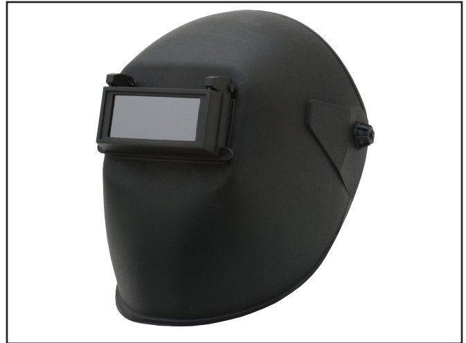
Figure 1. Model H7787.

The headband and middle strap must be properly adjusted before flipping the helmet down by nodding your head. If the headband is too loose, the helmet may tumble off after being flipped down and the lenses could be damaged.