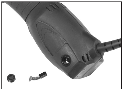
Figure 2. Brush replacement.