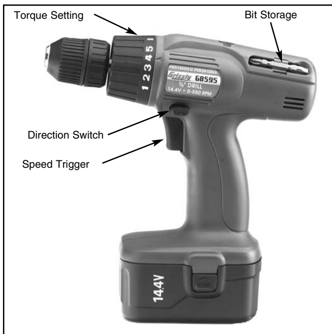
Fig 3. Location of controls.