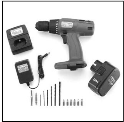
Fig1. Cordless tool kit contents.

The battery in your new cordless power tool will not be fully charged when you receive it. To maximize the storage capacity of the battery it should be completely discharged, then fully recharged 3-5 times.