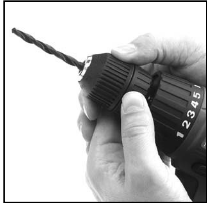
Fig 2. Inserting bits into the chuck.