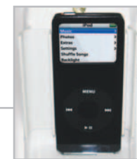
iPod™ Nano Shown