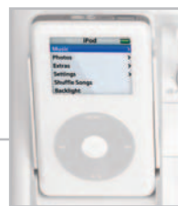
iPod™ Color Shown