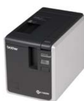
PT-9800PCN (USB, Serial, Host USB, Ethernet)