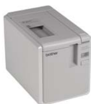
PT-9700PC (USB, Serial)