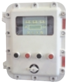
Optional control panel unit

Some of the most important international fashion industries such as Prada, Fendi and Gucci, who have been our customers for years, employ these air purifiers in their establishments.