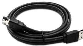
100 cm eSATA cable (2)

WARNING: Please remember to set the power supply to your local outlet voltage prior to plugging in the power cord. Failure to do so may damage the power supply.