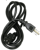
Power Cord (US Version Shown)