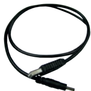
USB Power Cable

Dipswitch and SET Button: Used to control the Port Multiplier RAID Mode setting.