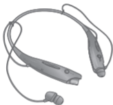
LG TONE+™ HBS-730