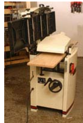
In the planer mode the JJP-12 handles boards up to 12" wide with power to spare.

The JET JJP-12 Jointer-Planer was designed to bring the much needed jointing and planing capabilities to your shop in a single, space-saving 55"-long by 39 1/2"-tall (top of fence) and 32"-deep (fence at its widest setting) package. Because of its space saving design and our focus on accuracy, function and durability, the JET JJP-12 Jointer-Planer is as economical as it is versatile.