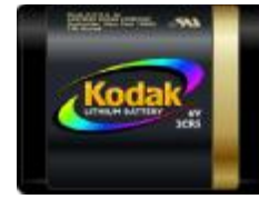
KL2CR5 Lithium 6v