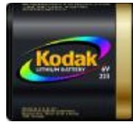
K223LA Lithium 6v