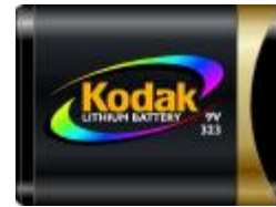
K323L Lithium 9V