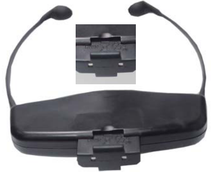
figure 2 Correct Battery Installation in the Headphones