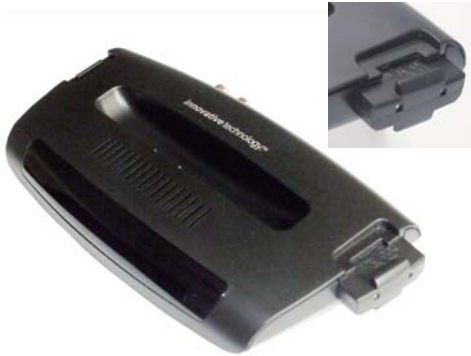
figure 1 Correct Battery Installation in the Transmitter