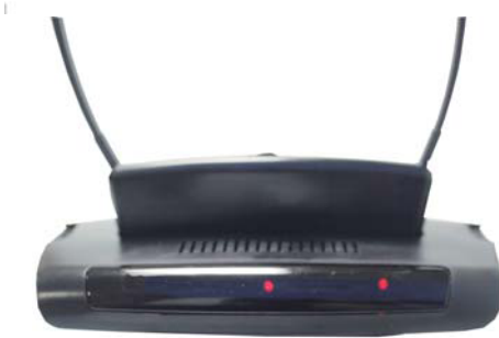
figure 3 2 LED's show the unit is charging.